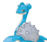
LAPRAS WATER ICE