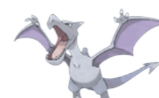
AERODACTYL ROCK FLYING