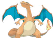
CHARIZARD FIRE FLYING