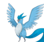
ARTICUNO ICE FLYING