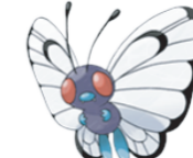
BUTTERFREE BUG FLYING