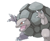
GOLEM ROCK GROUND