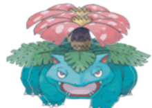
VENUSAUR GRASS POISON