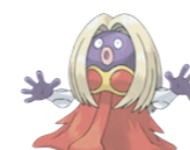
JYNX ICE PSYCHC