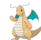
DRAGONITE DRAGON FLYING