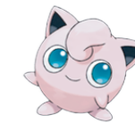
JIGGLYPUFF NORMAL FAIRY