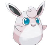
WIGGLYTUFF NORMAL FAIRY