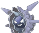
CLOYSTER WATER ICE