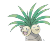
EXEGGUTOR GRASS PSYCHC