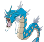
GYARADOS WATER FLYING