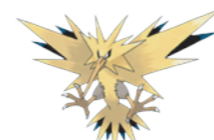
ZAPDOS ELECTR FLYING