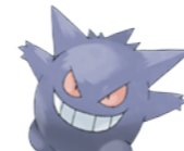
GENGAR GHOST POISON