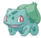
BULBASUR GRASS POISON